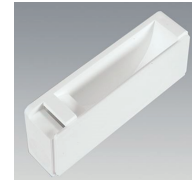
3/4" - 1"